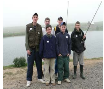
Angus Schools Castaways at Kingennie

To become a castaway you can join online at the above address.