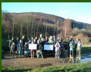
River Spey Angling Association leaders and juniors