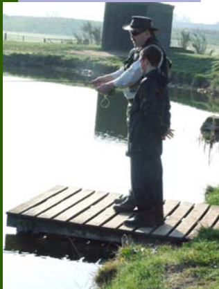
Coaching at Kingennie fishery